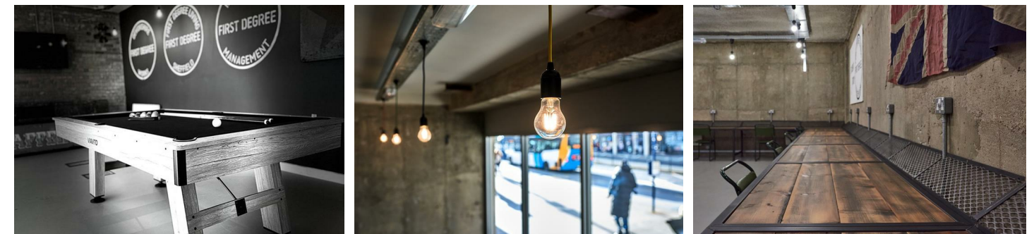
Apartment 16, 3 rd Floor, Forge House, 17 Arundel Gate, Sheffield, S1 2PN